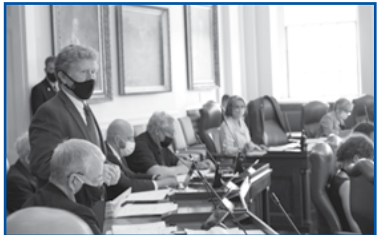
Addressing my Senate colleagues about the urgent need to reform our child welfare system