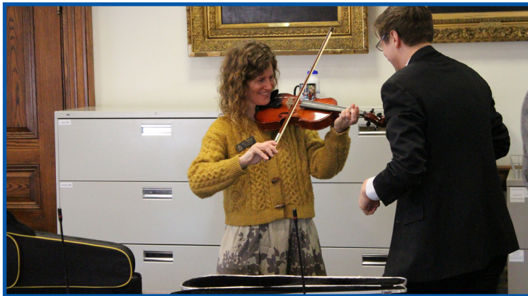
I got to welcome Portland Symphony Orchestra leaders to the state house and had the chance to learn from them.