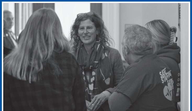
Catching up with nurses and advocates for health care workers in the halls of the state house.

Infrastructure and Rebuilding Commission will be central to this work. I look forward to reviewing its recommendations and working together, including private homeowners, to ensure that Maine’s economy and infrastructure become more resilient. It is vital that we continue to support our communities and working waterfronts.