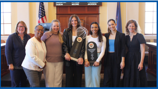
Honoring the UMaine Women's Basketball Team, 2024 America East Conference Champions, in the Senate.