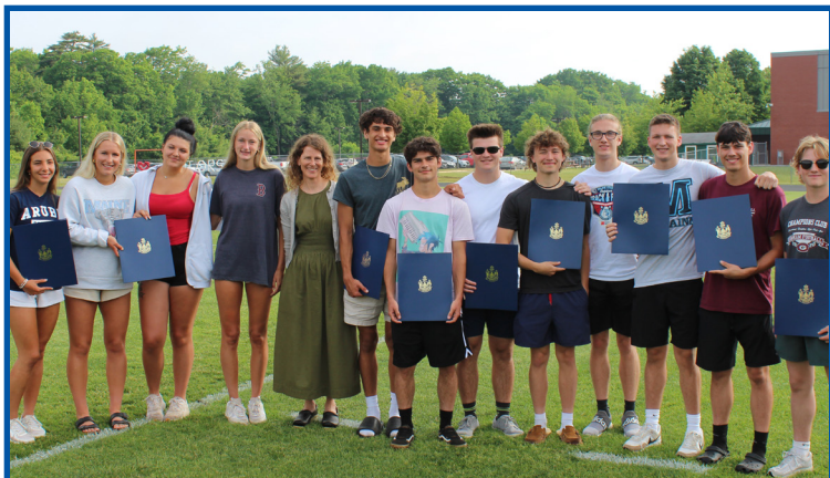
Recognizing the stellar student athletes from the Gorham High School Class of 2024! I know they will go on to do great things!

We also worked to improve maternal and newborn health. My bill became a new law requiring insurance companies to cover donor breast milk. Access to donor breast milk is important to ensuring all new babies can thrive in Maine.